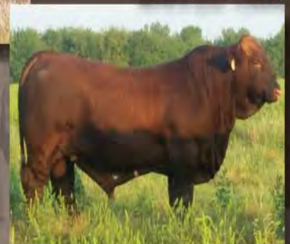
WPR'S 1722 - C1086436