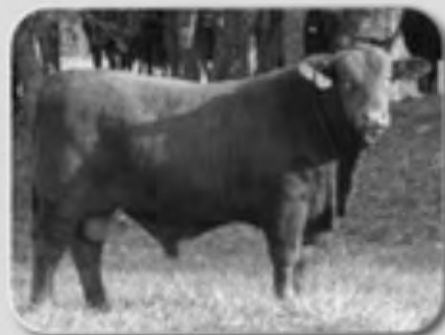
WPR Bringing Sexy Back, C1167871 Young service sire to some of the bred heifers in the sale