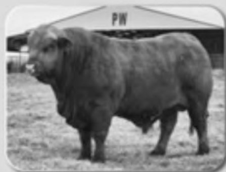
WPR Polled World Class, C1161474 Young service sire to some of the bred heifers in the sale

DVAuction.com (402) 316-5460 Must Pre-Register