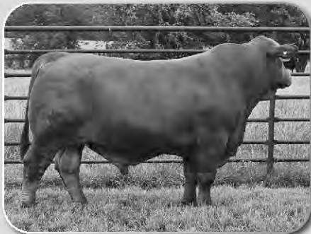
WPR Bringing Sexy Back C1167871

Service sire to some of the bred heifers in the sale