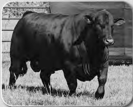
WPR Change It Up C1151125