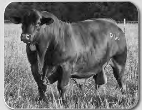
WPR Leading Edge C1138618

DVAuction.com (402) 316-5460 Must Pre-Register