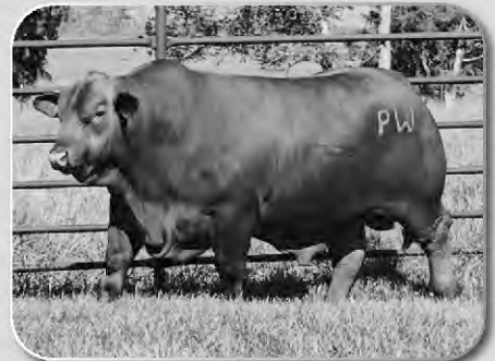
WPR World Class C1161474

Service sire to some of the bred heifers in the sale