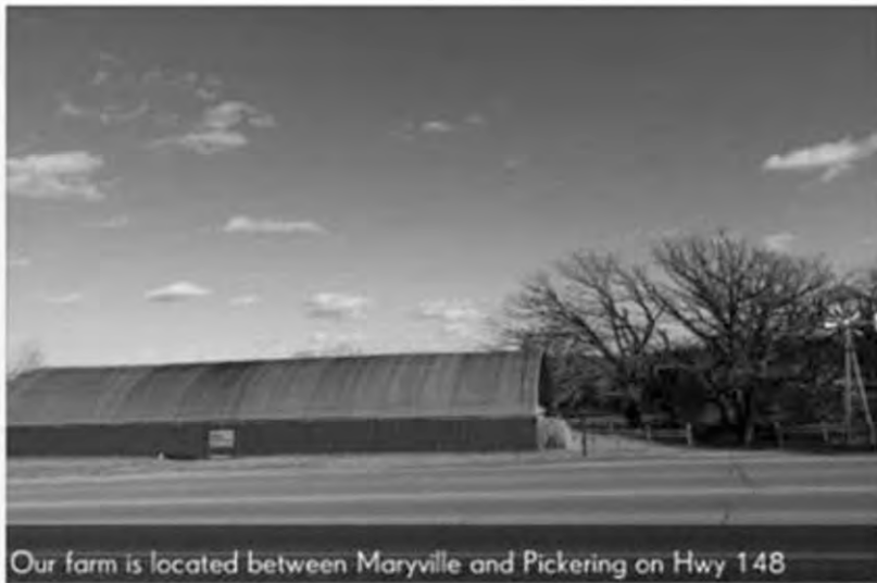
Our farm is located between Maryville and Pickering on Hwy 148